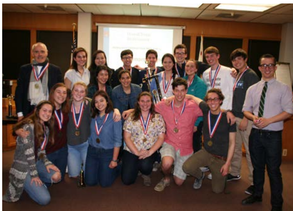
Miramonte's award-winning 2016 Mock Trial team.